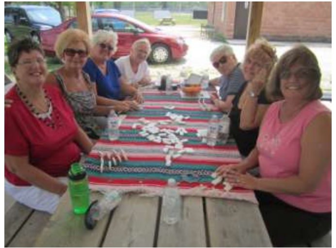
Train, a domino game, was very popular as well.