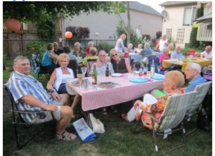
Say cheese! Hungry diners waiting for the food