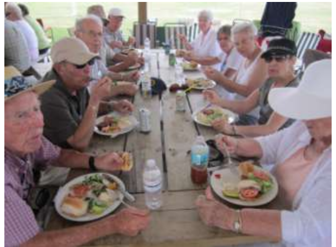
Perhaps this was the most popular activity of all at our annual July picnic.