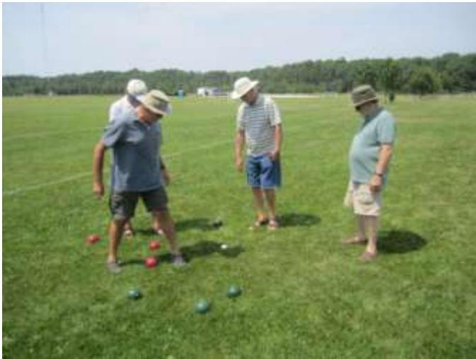
Looks like we have no winner, boys. (Note that is not the first comment that came to mind – see next photo below)

HERE ARE A FEW PHOTOS FROM OUR ANNUAL JULY PICNIC AT THE SPORTS PARK.