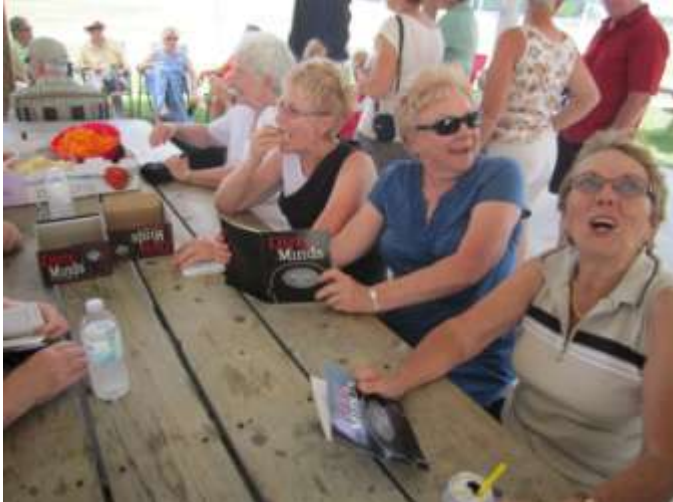
This game proved to be popular.