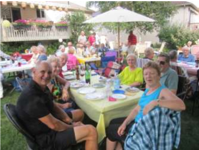
THE VARIOUS SHADES OF ...GREY?