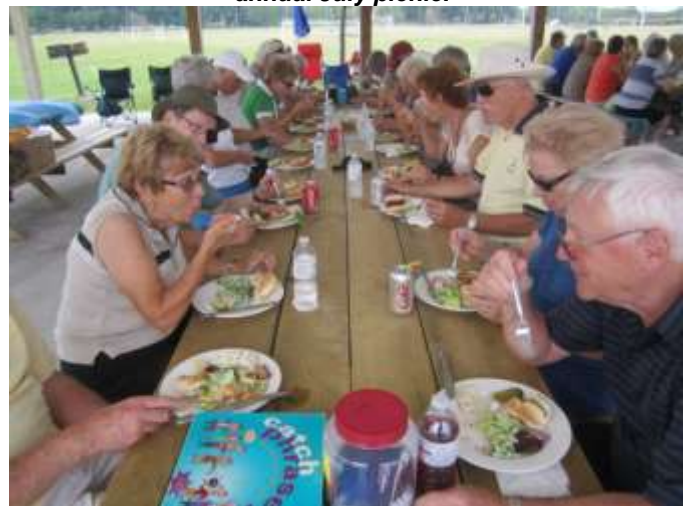
More of the most popular activity IN THE MIDDLE OF THE SUMMER'S BLISTERING TEMPERATURES, A STEADY BREEZE KEPT THE HEAT AWAY. IT WAS A LOVELY DAY.