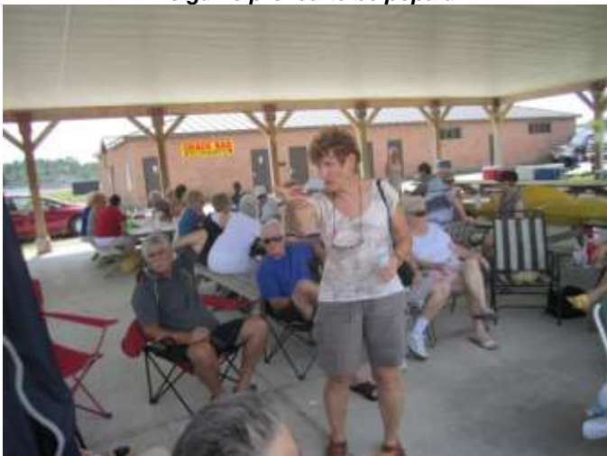
There's a good game over there, you know...