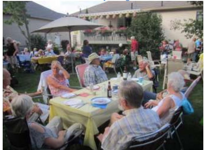
Good conversation is always part of the enjoyment