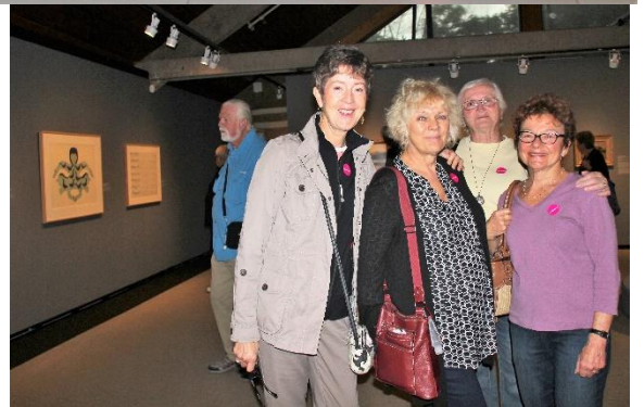
Our "Group of Four" painters