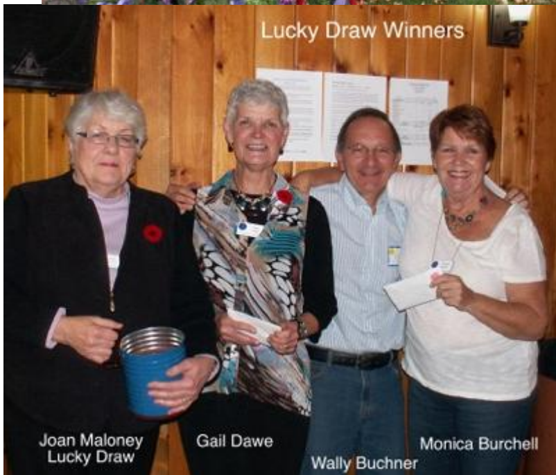
Lucky Draw Winners