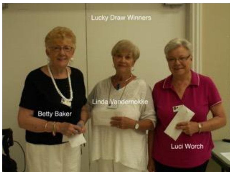
Lucky Draw Winners

PLEASE BRING COINS TO THE LUCKY DRAW TABLE AND BUY TICKETS BEFORE THE MEETING STARTS.