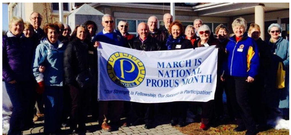
Wasaga Beach PROBUS clubs at town hall flag raising. Recognize anyone?