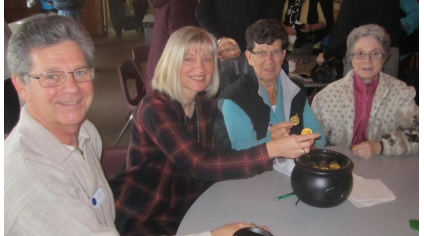
Lucky winners of the "pot of gold"