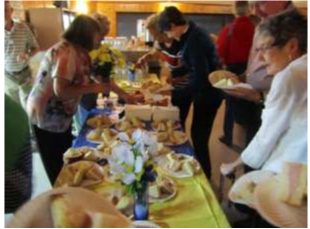
Everyone seemed to enjoy the delicious food