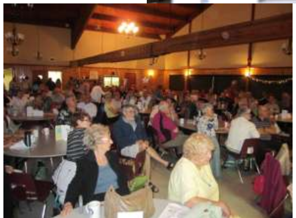
Members loved the show and showed their appreciation.