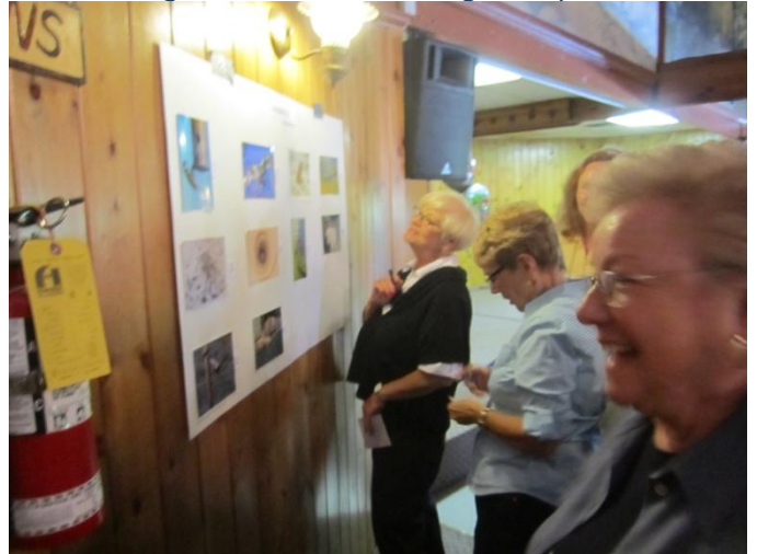
The pressure shows as there were lots of difficult decisions to be made.