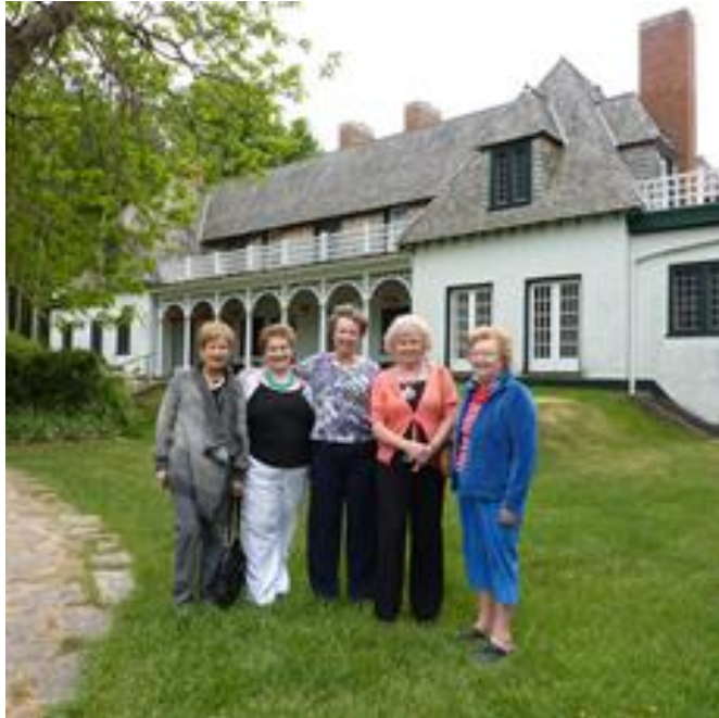
Daytripper members pose in front of Leacock Museum.

Sir Henry Pellet (of Casa Loma fame) and they had 1 child. The family moved to Montreal