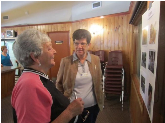
Members took their time judging all the photos.

Final Update: Winning photos will be marked and winners' names will be posted at this month's meeting. Each category winner will win a photo frame with a small bronze plaque. The grand prize