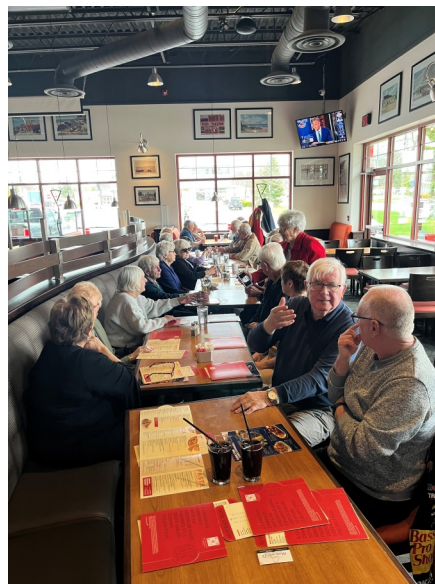
After meeting gathering at Boston Pizza