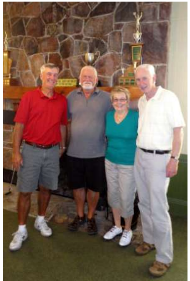
The winners of our 2013 Probus tournament