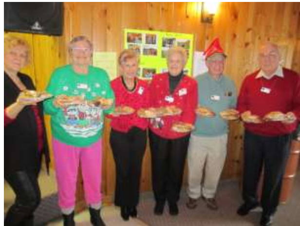
Lucky winners of Christmas treats

PLEASE BRING COINS TO THE LUCKY DRAW TABLE AND BUY TICKETS BEFORE THE MEETING STARTS