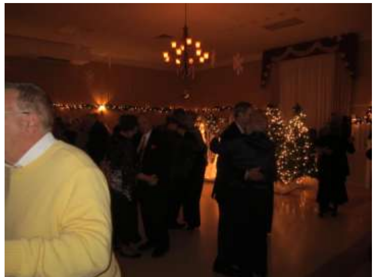
Do you see anybody you recognize?