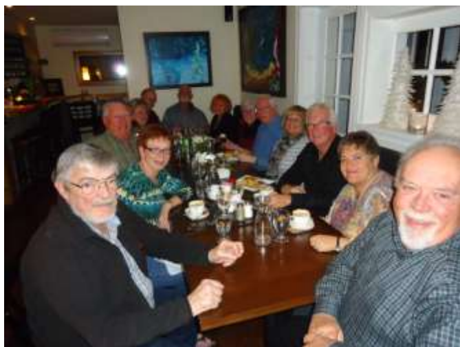
The happy diners in Thornbury